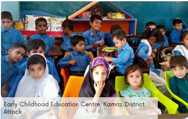
Early Childhood Education Centre, Kamra, District Attock