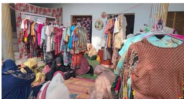
Vocational Training Camp – Village Sarai Salah, District Haripur Date: 27 December 2025

GBTI successfully concluded its two-month Vocational Training Camp at Village Sarai Salah, District Haripur. A total of 15 dedicated female trainees completed hands-on training in dress designing, cutting and stitching.