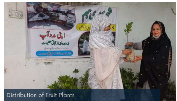
Distribution of Fruit Plants