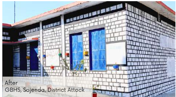
After GBHS, Sojenda, District Attock