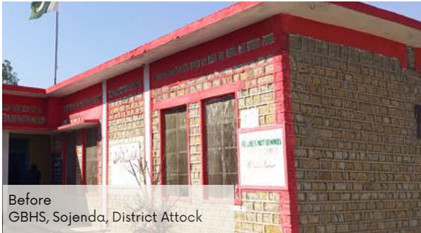
Before GBHS, Sojenda, District Attock