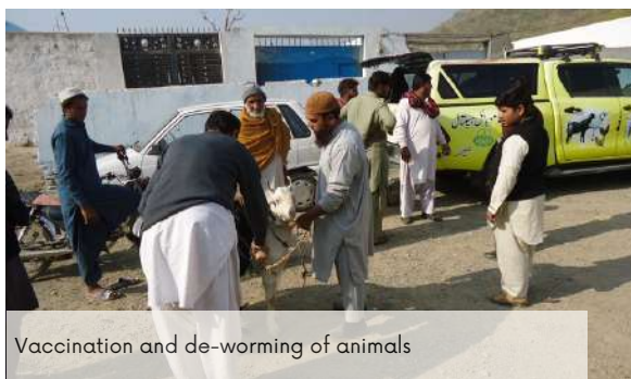
Vaccination and de-worming of animals