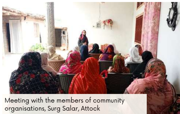
Meeting with the members of community organisations, Surg Salar, Attock

This “three tier model” (COs/VOs/LSOs) ensures