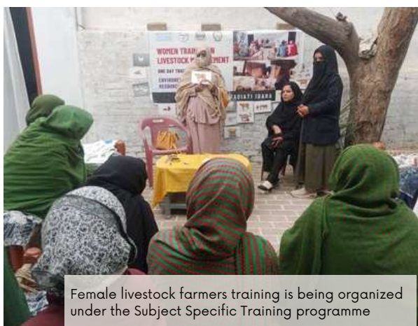
Female livestock farmers training is being organized under the Subject Specific Training programme

The Staff training portfolio ensures capacity building through three programmes: