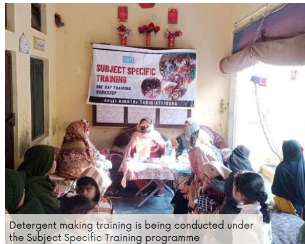
Detergent making training is being conducted under the Subject Specific Training programme

Management development training, Microfinance training, and Intern training programme.