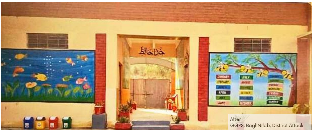
After GGPS, BaghNilab, District Attock