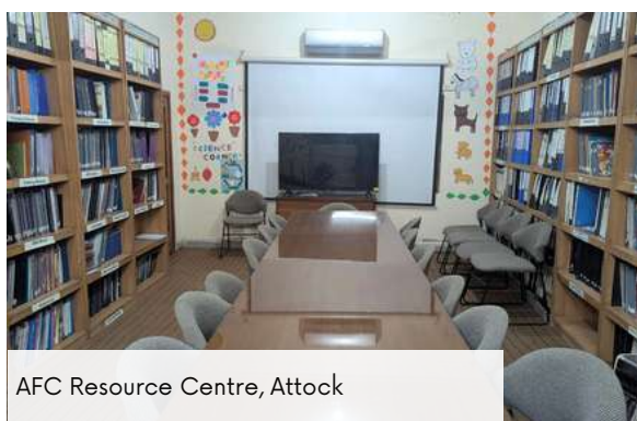
AFC Resource Centre, Attock

GBTI has shared the categorization of pending land compensation payments with WAPDA for taking appropriate steps for 79% of total PAPs whose payments are below Rs.10,000/-. GBHP-WAPDA developed three orchards of oranges on spoil banks, every year the auctions of these orchards take place to sell oranges to local community farmers. GBTI as a member not only participates in auctions but also disseminates information through activists and community organisations.