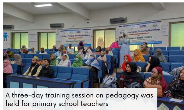
A three-day training session on pedagogy was held for primary school teachers