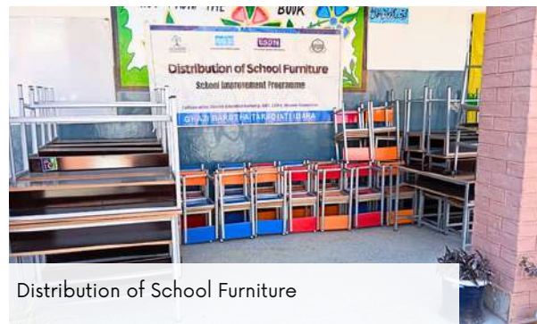
Distribution of School Furniture