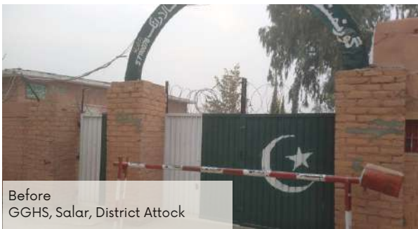
Before GGHS, Salar, District Attock