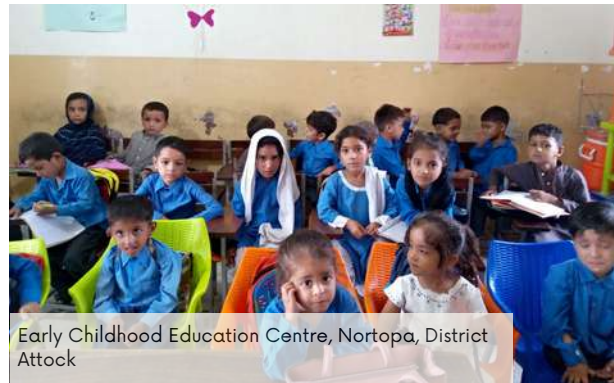
Early Childhood Education Centre, Nortopa, District Attock