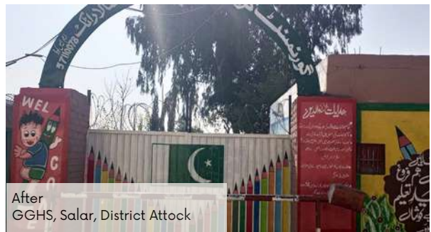
After GGHS, Salar, District Attock