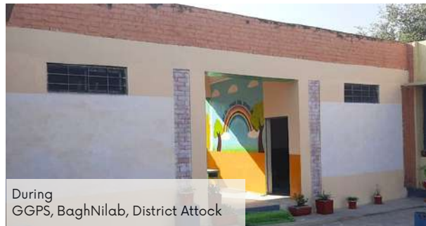
During GGPS, BaghNilab, District Attock