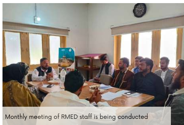
Monthly meeting of RMED staff is being conducted

Based on its extensive experience GBTI regulates the ceiling for different activities to a maximum of Rs.150,000/-, however, currently average loan size is only Rs.29,685/-