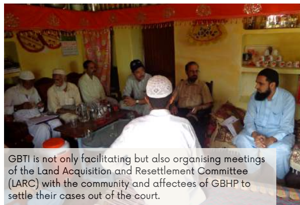
GBTI is not only facilitating but also organising meetings of the Land Acquisition and Resettlement Committee (LARC) with the community and affectees of GBHP to settle their cases out of the court.

On the 13th of Aug, 2015 WAPDA constituted a "Land Acquisition and Resettlement Committee" (LARC) to scrutinize applications