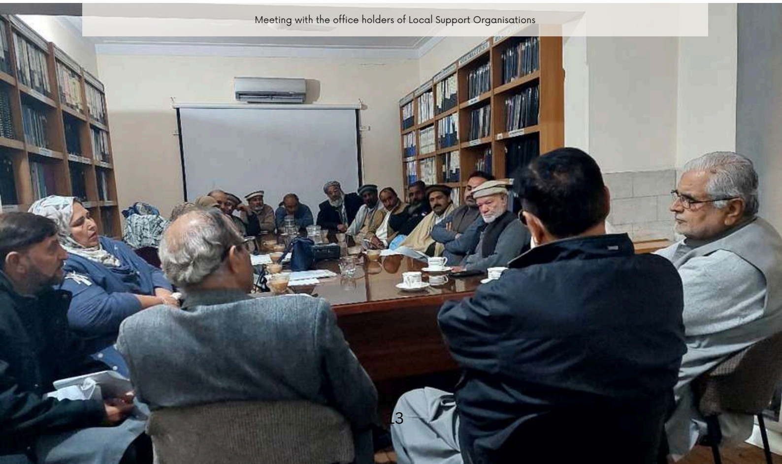
Meeting with the office holders of Local Support Organisations

In GBTI programme are the process of social mobilisation was carried out in 1995 while implementing the Integrated Regional Development Plan and for the land compensation payments to affectees. Local Support Organisations fostered by GBTI at union council level are continuously developing linkages with government and non-government departments for developmental activities and poverty alleviation achieving the seventeenth SDG “The partnerships for the goals” and on self-help basis;