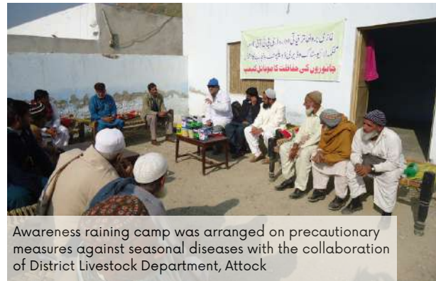
Awareness raising camp was arranged on precautionary measures against seasonal diseases with the collaboration of District Livestock Department, Attock

ENRM sector continues to foster productive linkages of COs with the line departments for the purpose of taking benefits from their services. It has established linkages of COs with the agriculture extension department, soil