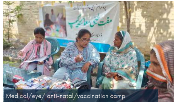
Medical/eye/ anti-natal/vaccination camp