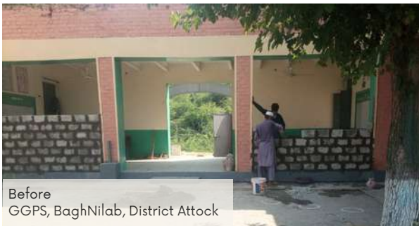
Before GGPS, BaghNilab, District Attock