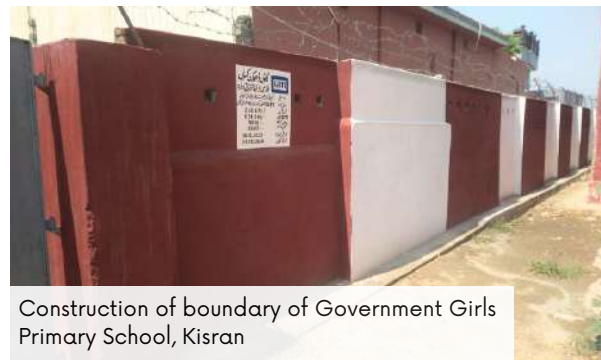
Construction of boundary of Government Girls Primary School, Kisan