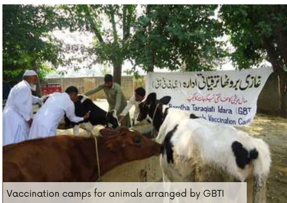
Vaccination camps for animals arranged by GBTI