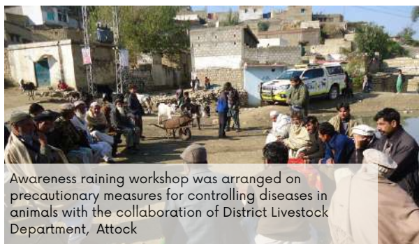
Awareness raising workshop was arranged on precautionary measures for controlling diseases in animals with the collaboration of District Livestock Department, Attock