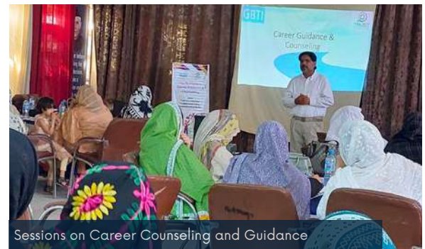
Sessions on Career Counseling and Guidance