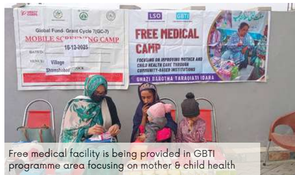
Free medical facility is being provided in GBTI programme area focusing on mother & child health

The partnership between men and women: It involves working with men and women to bring